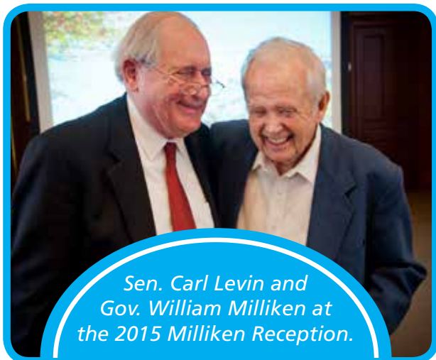
Sen. Carl Levin and Gov. William Milliken at the 2015 Milliken Reception.