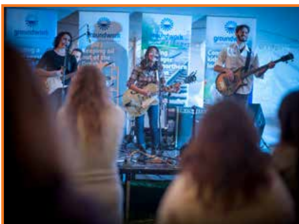
The Crane Wives brought down the house (or tent) with a great set after the Harvest feast.