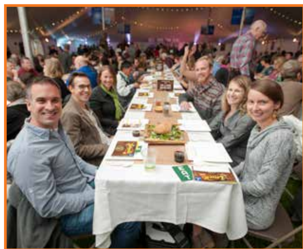
Nearly 600 people showed up for an all-local feast prepared by Harvest Restaurant and the Great Lakes Culinary Institute.