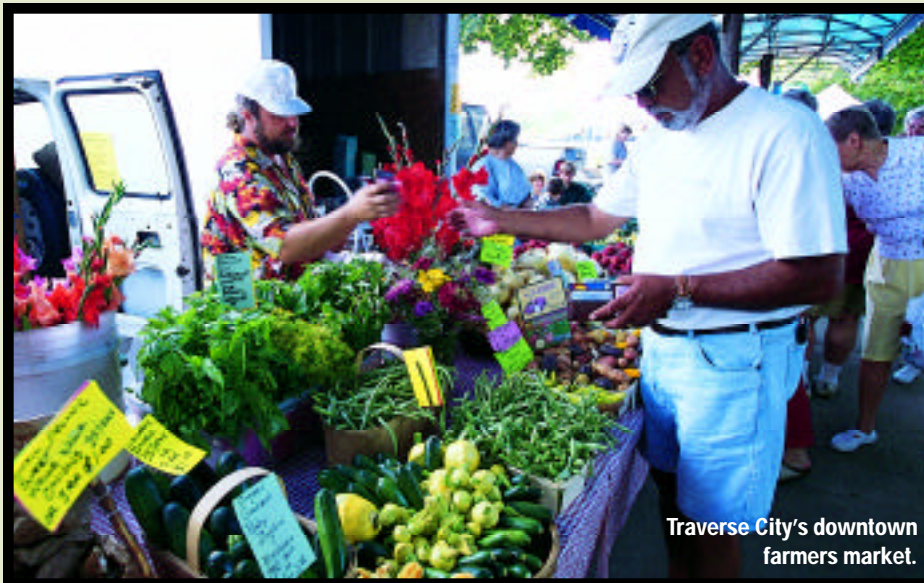
Traverse City's downtown farmers market.