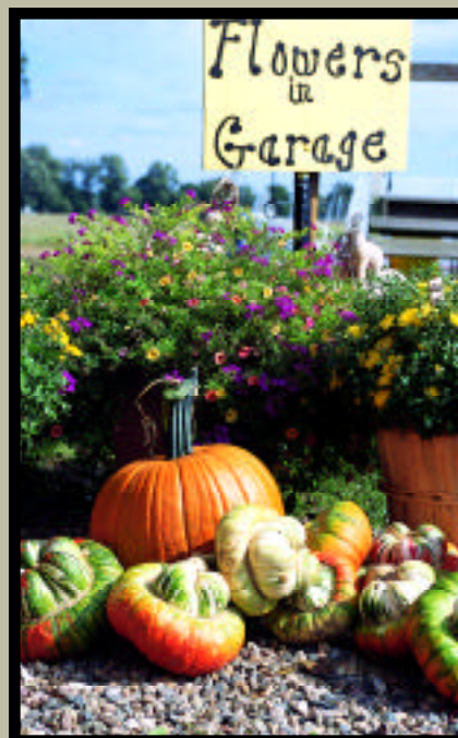
Bosserd Farm Market

But fresh food and real people are the best selling points. "Our average customer wants a relationship with a farmer and to know the food is picked fresh every day."