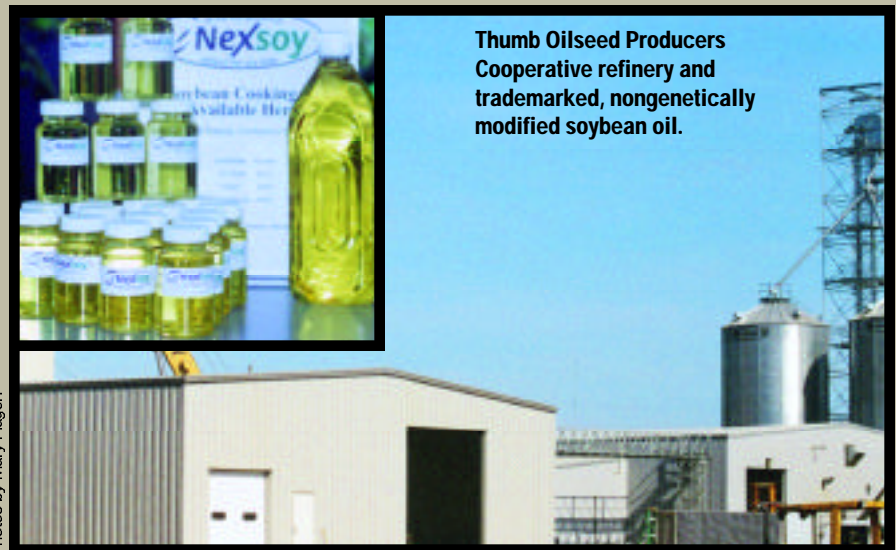
Thumb Oilseed Producers Cooperative refinery and trademarked, nongenetically modified soybean oil.