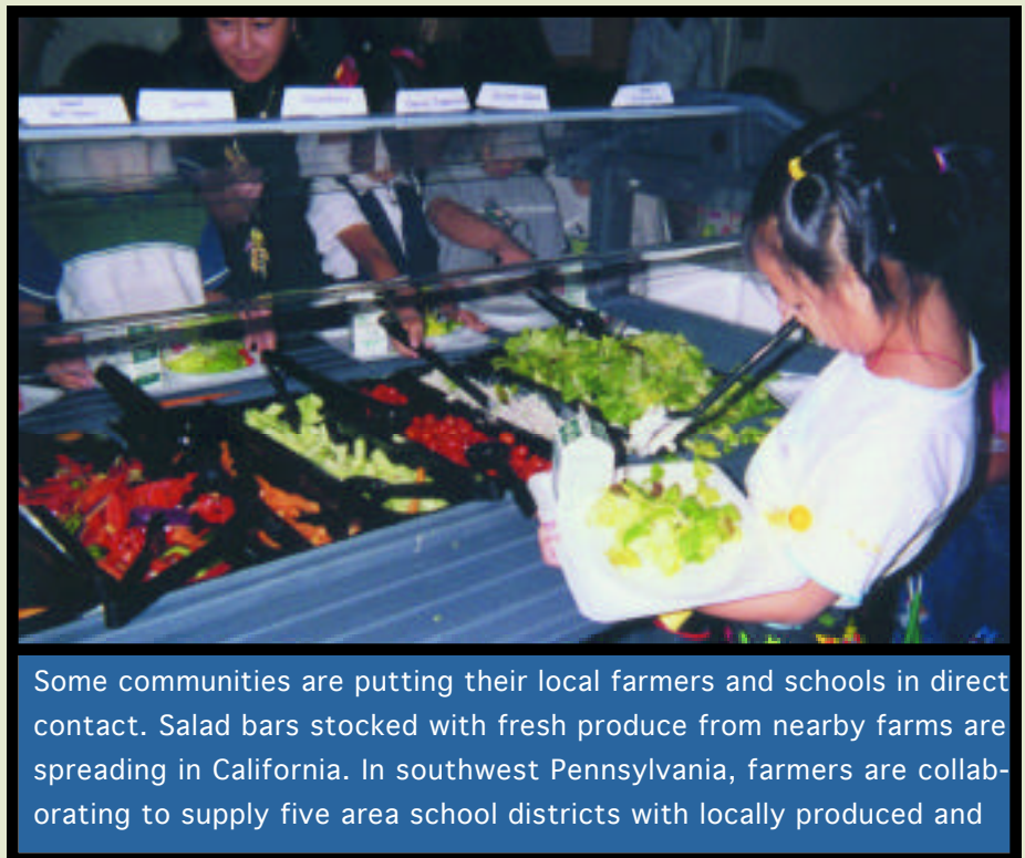
Some communities are putting their local farmers and schools in direct contact. Salad bars stocked with fresh produce from nearby farms are spreading in California. In southwest Pennsylvania, farmers are collaborating to supply five area school districts with locally produced and

Already showing success in North Carolina, Florida, and Virginia, the Small Farms/School Meals Initiative now is